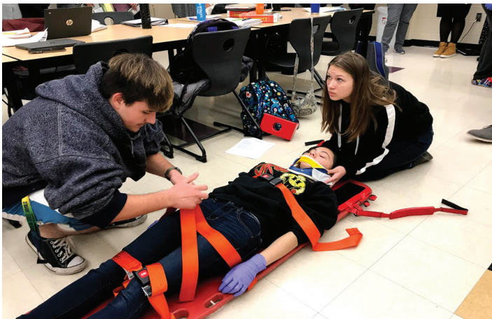
Safe techniques for stabilizing and transporting a patient are emphasized in the Emergency Medical Services class based at Hobart High. Senior year is the best time to take this class.

Applications and 2020-21 program booklets are available from school counselors at Boone Grove, Chesterton, Hebron, Hobart, Kouts, Morgan, Portage, Valparaiso, Washington and Wheeler High Schools.