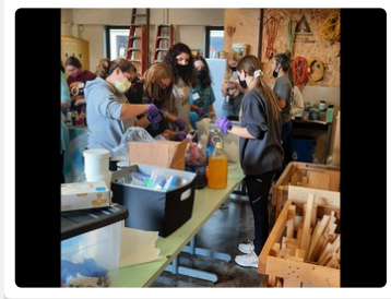
More Tie Dye Fun