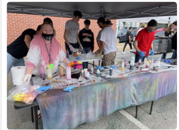
Look at those colors!