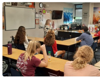
Nursing Professional Guest Speaker