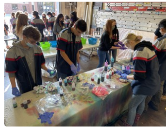
Tie Dye Fun