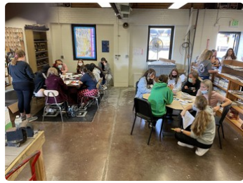
Making cards for the patients