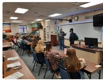
HOSA State Representative