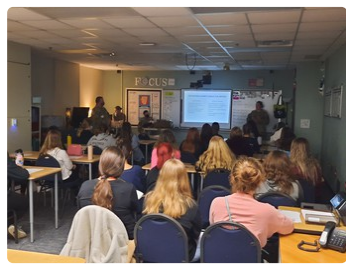
Army National Guard Guest Speaker