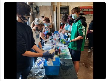
Tie Dye Fun