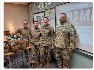
Army National Guard Guest Speakers